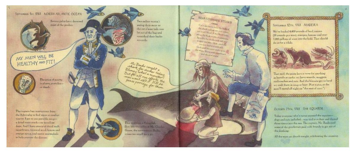
Figure 2. Static and mobile images. (Bishop, 2018a, pp. 7–8)

Thompson's log entries for September 1st, 12th and October 25th, 1768, and the accompanying doublepage illustration of the Endeavour's period in the North Atlantic Ocean and crossing of the equator emphasise restriction and movement. For example, a close-up static image of the solitary Cook shows him standing erect, arms folded, gaze unflinching as he seeks to stamp out scurvy while avowing, "MY MEN <u>WILL</u> BE HEALTHY AND FIT!" (Bishop, 2018a, p. 7), implying he is locked within a class of his own. Porthole frames, like those on the first endpapers, similarly portray imprisonment and stasis, with crew members trapped within the Endeavour . And then there is the shark that has been hauled from its natural habitat, ironically by Banks the naturalist, to lay prostrate in death on the ship's deck where it is dissected to provide the crew's dinner (see Figure 2).