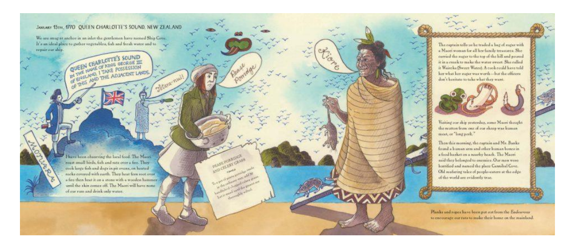
Figure 4. Māori and Pākehā: Fusion and confusion. (Bishop, 2018a, pp. 19–20)

reproduces history by having Cook stand on the island's summit to take possession of it and adjacent lands in the name of King George III, while his failure to communicate adequately with Māori is suggested in the placement opposite but apart from him of a Māori chief (see Figure 4).