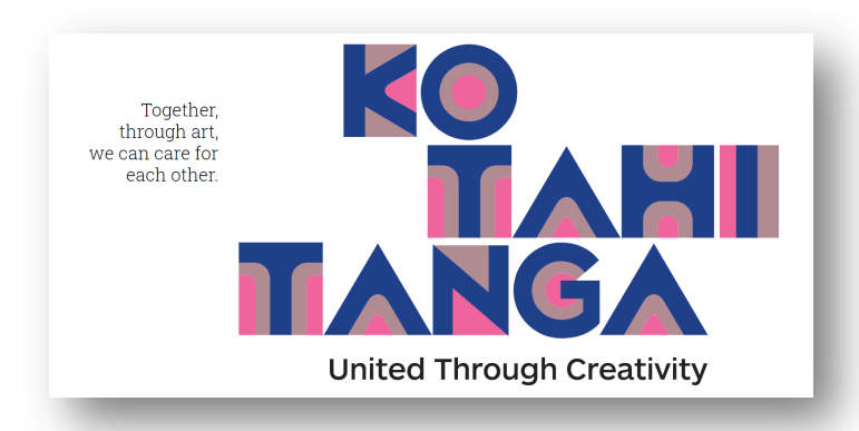
Figure 1. The landing page of the Kotahitanga Gallery website.

Government, 2020) has moved back to Alert Level 3. Picture a hard angry boil. Now be brave, if you will, and stab it with a rusty pin.