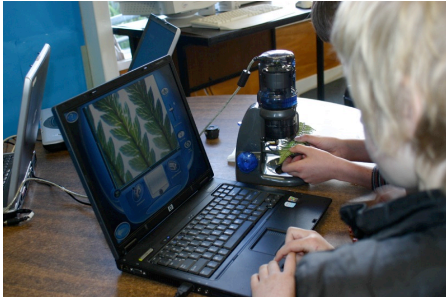
Figure 1. Students using the digital microscopes and laptops Scion provided

search strategies using Google (and other search engines) using the class data projector, before allowing the groups to undertake independent investigation.