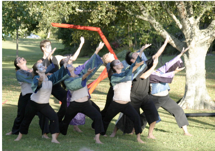
Photo 7. Performers in Home, land and sea

[Please click Photo 7 below to play Video 4. Stop and start at any time by clicking on the Play/Pause button.]