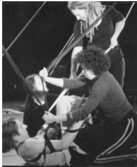
Photo 6. Rehearsing for performances of Kaitiaki. Reasons to care 10

[Please click Photo 6 below to play Video 3. Stop and start at any time by clicking on the Play/Pause button.]