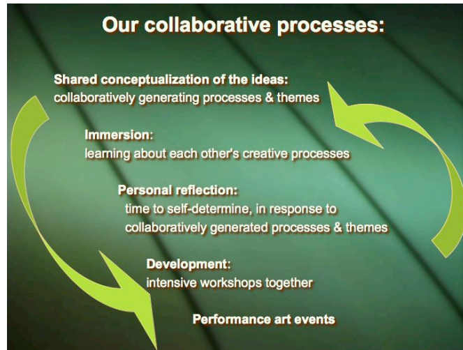
Figure 1. Our collaborative processes

In the final section of this paper we discuss our shared conclusions.