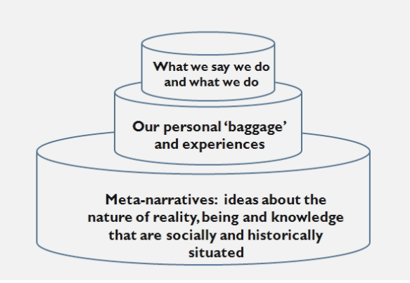
Figure 1. Pedagogical tool prompting discussions about layers of experience

This first tool, represented in Figure 1, relates to the different layers of experience and of data collected in the project. At the top of the cake we have "what we say we do and what we do"; this layer relies on our personal baggage of individual experiences. These personal experiences, in turn, are grounded on collective experiences that are socially and historically situated. These social experiences circulate meta-narratives that give us ideas about the nature of reality, being and knowledge. We have used this tool to explore the implications of "shaking" the foundations of the cake (i.e. shifting conceptualisations of knowledge, reality, learning and identities) in terms of what would happen to the top layers.